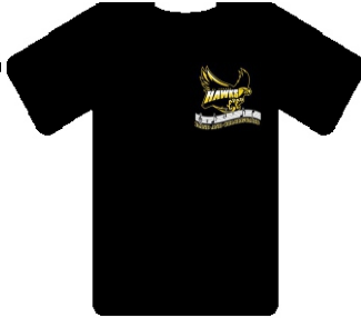
LADIE'S SCOOP NECK