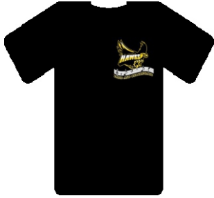
MEN'S CREW NECK

ORDER FORM DUE BY: AUG 30, 2019 AT 3PM IN THE BLACK BOX